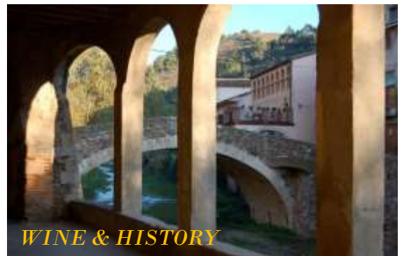
WINE & HISTORY