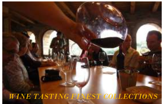
WINE TASTING FINEST COLLECTIONS