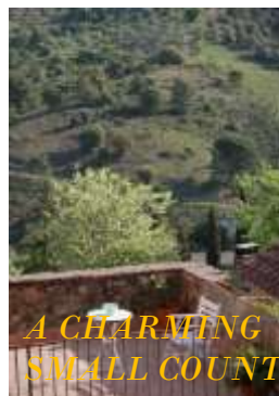
A CHARMING SMALL COUNTRY HOTEL