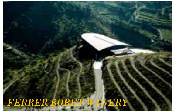
FERRER BOBET WINERY