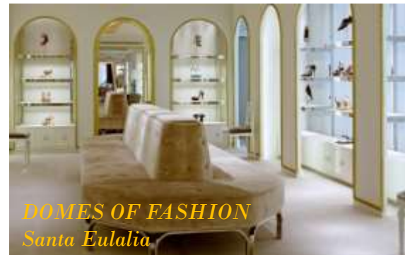
DOMES OF FASHION Santa Eulalia