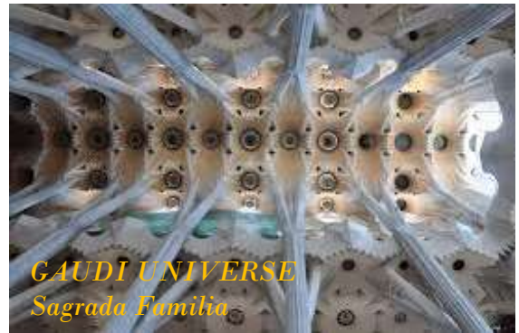
GAUDI UNIVERSE Sagrada Família