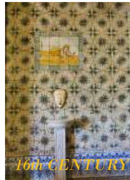
16th CENTURY PALACE

Cal Compte has converted the area under the eaves into 8 luxury bedrooms — three are standard doubles, two are superior and three are suites. The space is decorated in a minimalist style and is very light and airy.