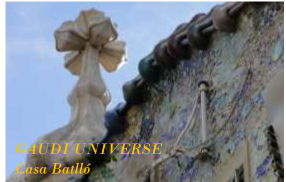
GAUDI UNIVERSE Casa Batlló