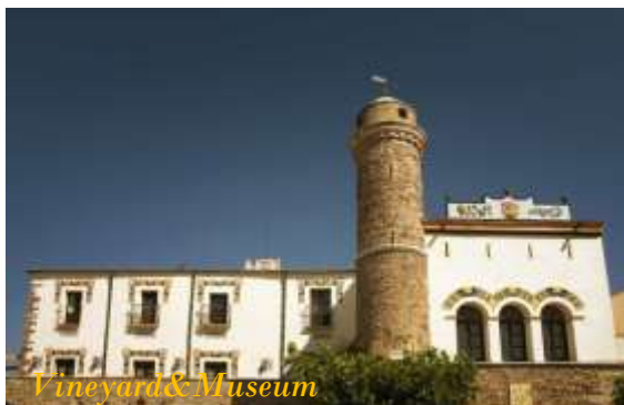
Vineyard & Museum