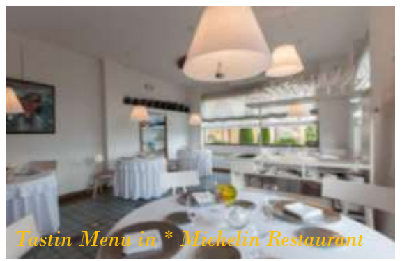
Tastin Menu in * Michelin Restaurant