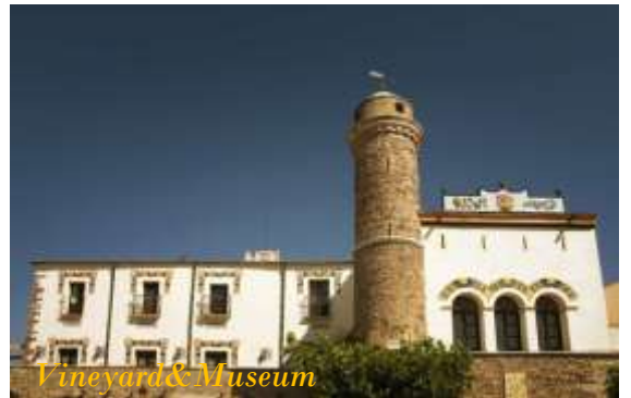
Vineyard & Museum