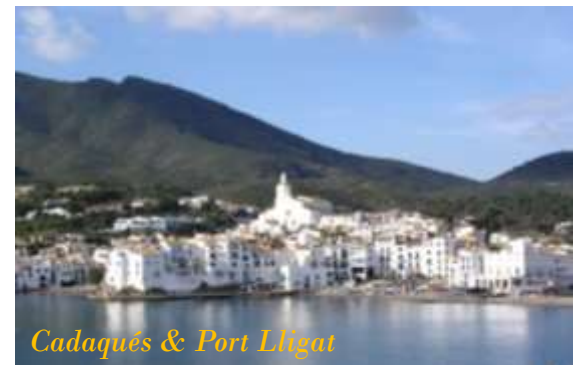
Cadaqués & Port Lligat