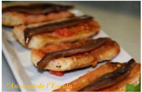
"Anxoves de l'Escala"