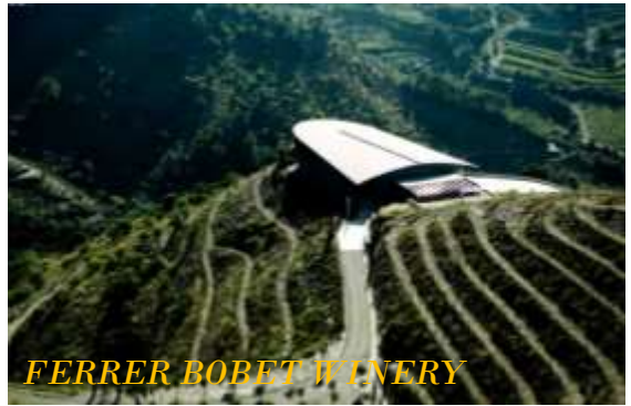
FERRER BOBET WINERY