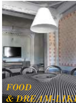
FOOD & DREAM-LIKE