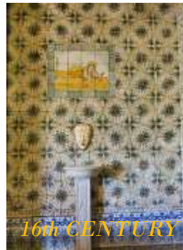
16th CENTURY PALACE

Cal Compte has converted the area under the eaves into 8 luxury bedrooms — three are standard doubles, two are superior and three are suites. The space is decorated in a minimalist style and is very light and airy.